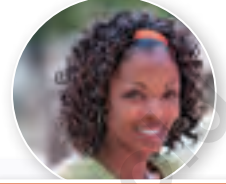
mother 35 June