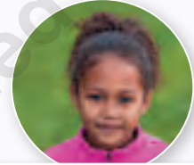
sister 7 September