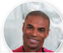
father 39 November